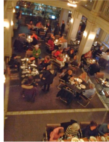
Theater patrons/Livingston guests.

Here are a few pictures from my dining experience at Livingston. The patrons were lively, trendy, and very metropolitan. Many had stopped in for drinks before a show at the Fox Theater across the street from the hotel.