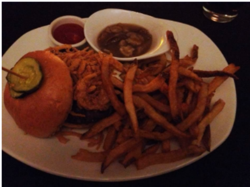
My tasty meal. Check out the menu here .