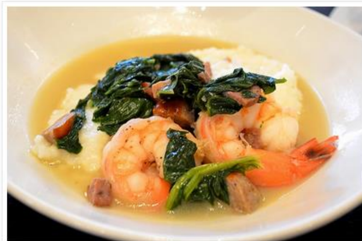
Peachtree Food Tours, Livingston, Shrimp & Grits